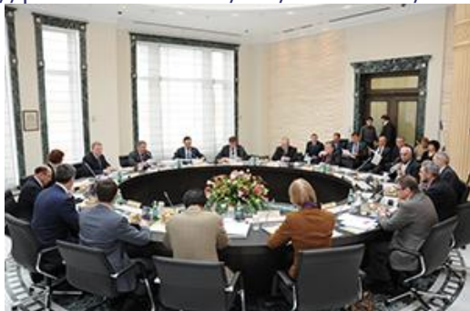
Meeting of Leontief Centre delegation with Rustam Minnikhanov , President of Tatarstan Republic 02.03.2013.

http://prav.tatarstan.ru/rus/index.htm/news/184802.htm